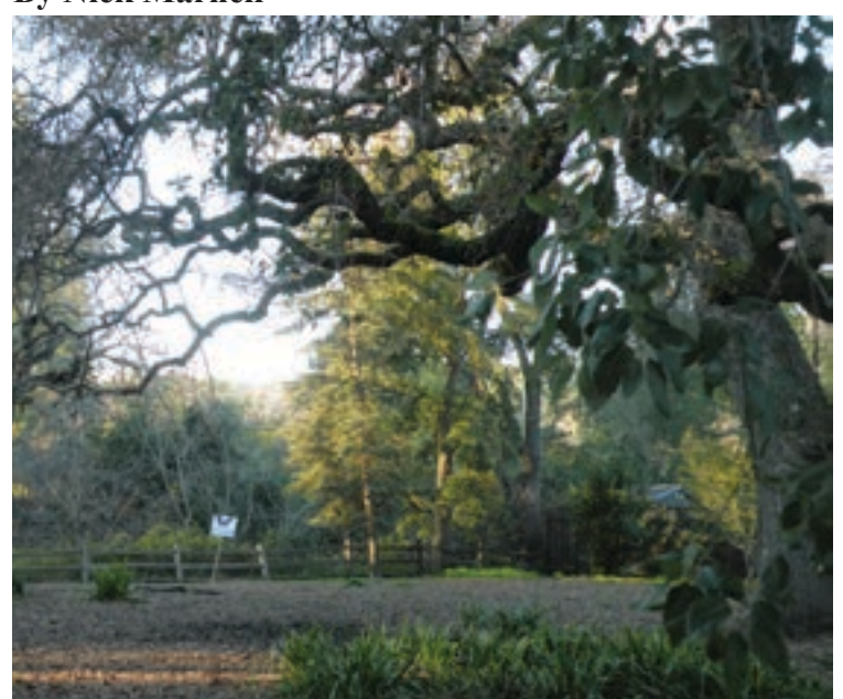
Leigh Creekside Park